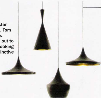
LOS ANGELES Handmade by master craftsmen in India, Tom Dixon's Beat Lights ($420 each) stand out to Twentieth clients looking for something distinctive