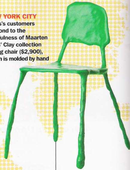
NEW YORK CITY Moss's customers respond to the playfulness of Maarten Baas' Clay collection dining chair ($2,900), which is molded by hand