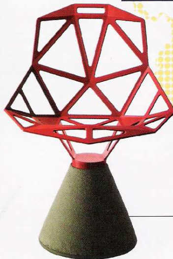
SANTIAGO Interdesign's young customers flock to Magis' chair ONE ($480) because of its high-tech lines and industrial look