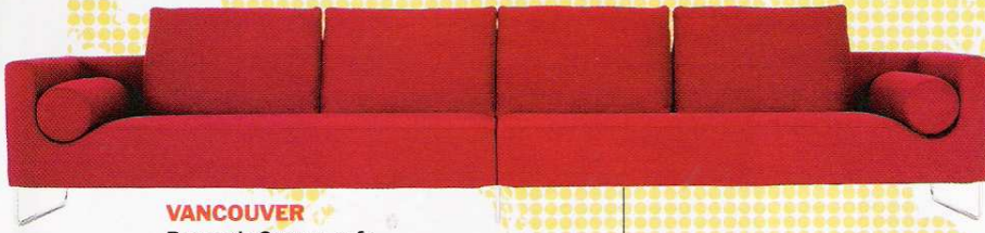
VANCOUVER Bensen's Canyon sofa ($5,020), available at Inform Interiors, was designed to keep its cushions in place

Colorful and one-of-a-kind pieces are dominating design this spring. Here, the hottest items from stores around the globe