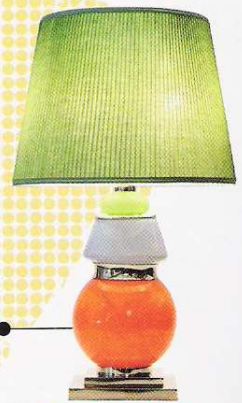
BUENOS AIRES 30quarenta's best-selling lamps ($950) were made by recycling glass globes found in an abandoned factory