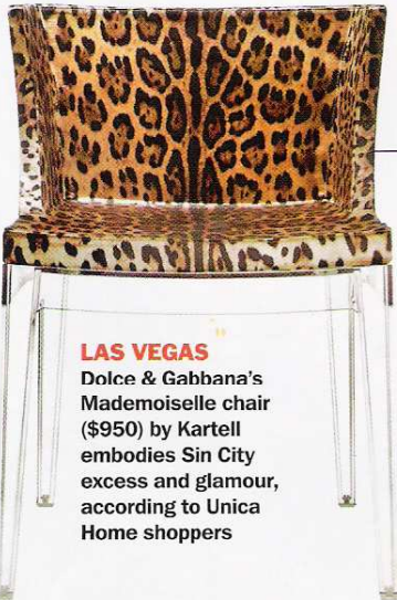
LAS VEGAS Dolce & Gabbana's Mademoiselle chair ($950) by Kartell embodies Sin City excess and glamour, according to Unica Home shoppers